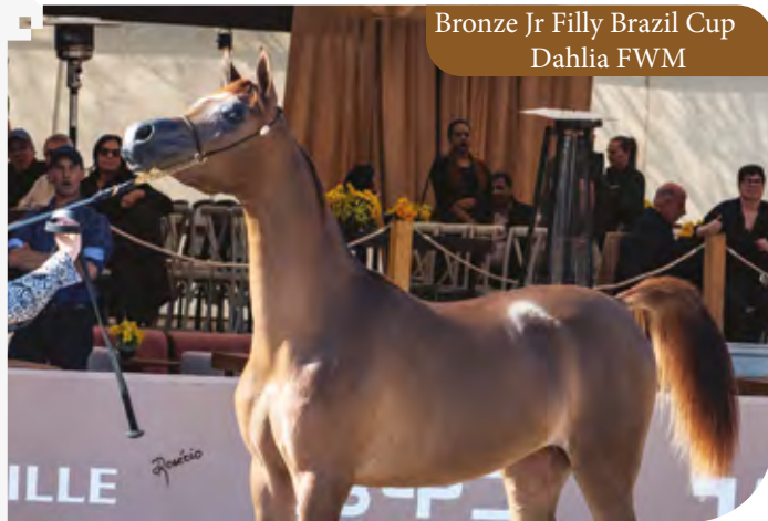
Bronze Jr Filly Brazil Cup Dahlia FWM

Lakyshah Moon RB. Shannarah's father is Fragonard K, bred by Haras Aratinga. He is a beautiful son of Shael Dream Desert, who is considered by many his father's ultimate heir.