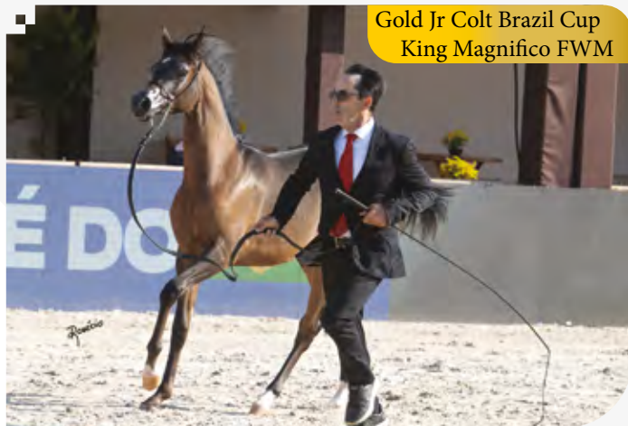
Gold Jr Colt Brazil Cup King Magnifico FWM

The Bronze Champion was Dahlia FWM, bred and owned by Haras Lone Star who was also the breeder of the Brazilian and U.S. National Champion Mare Queen Aida FWM. She is a daughter of the beautiful AJ Radman and out of Princess Sophia FWM who in turn is a daughter of the Brazilian National Champion Stallion Vaalente and out of the Brazilian aristocrat Only Serondella.