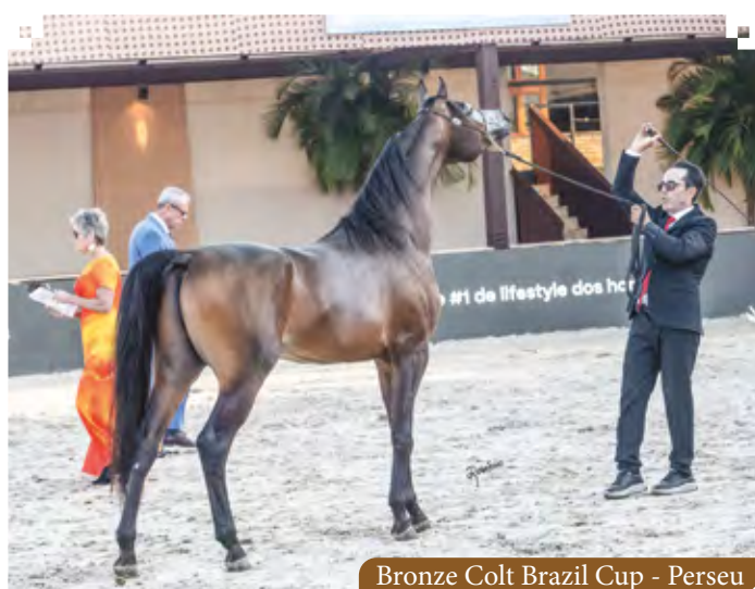
Bronze Colt Brazil Cup - Perseu