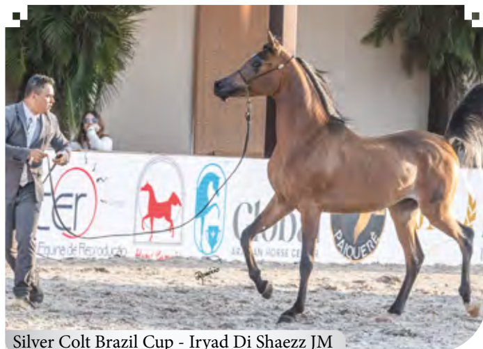
Silver Colt Brazil Cup - Iryad Di Shaezz JM