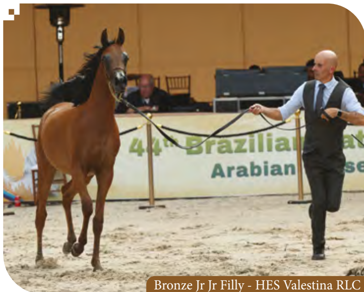
Bronze Jr Jr Filly - HES Valestina RLC