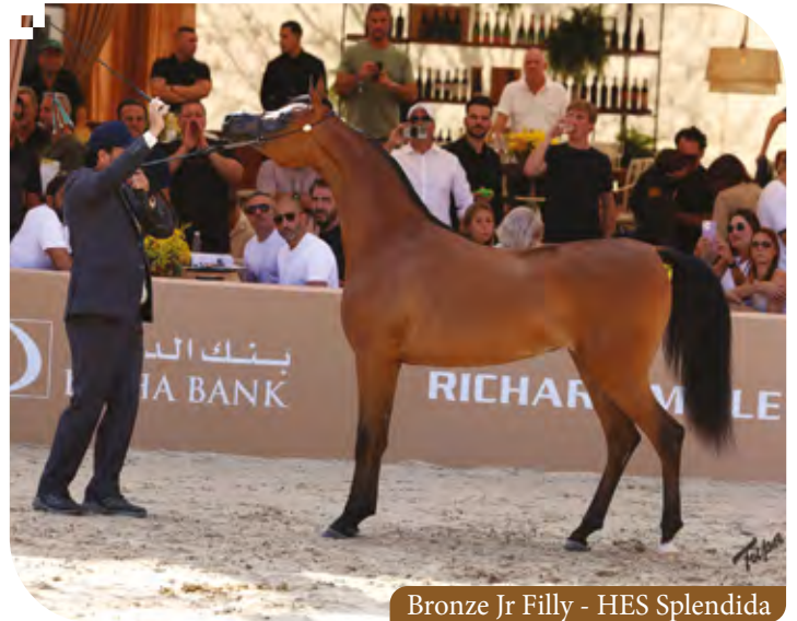
Bronze Jr Filly - HES Splendida