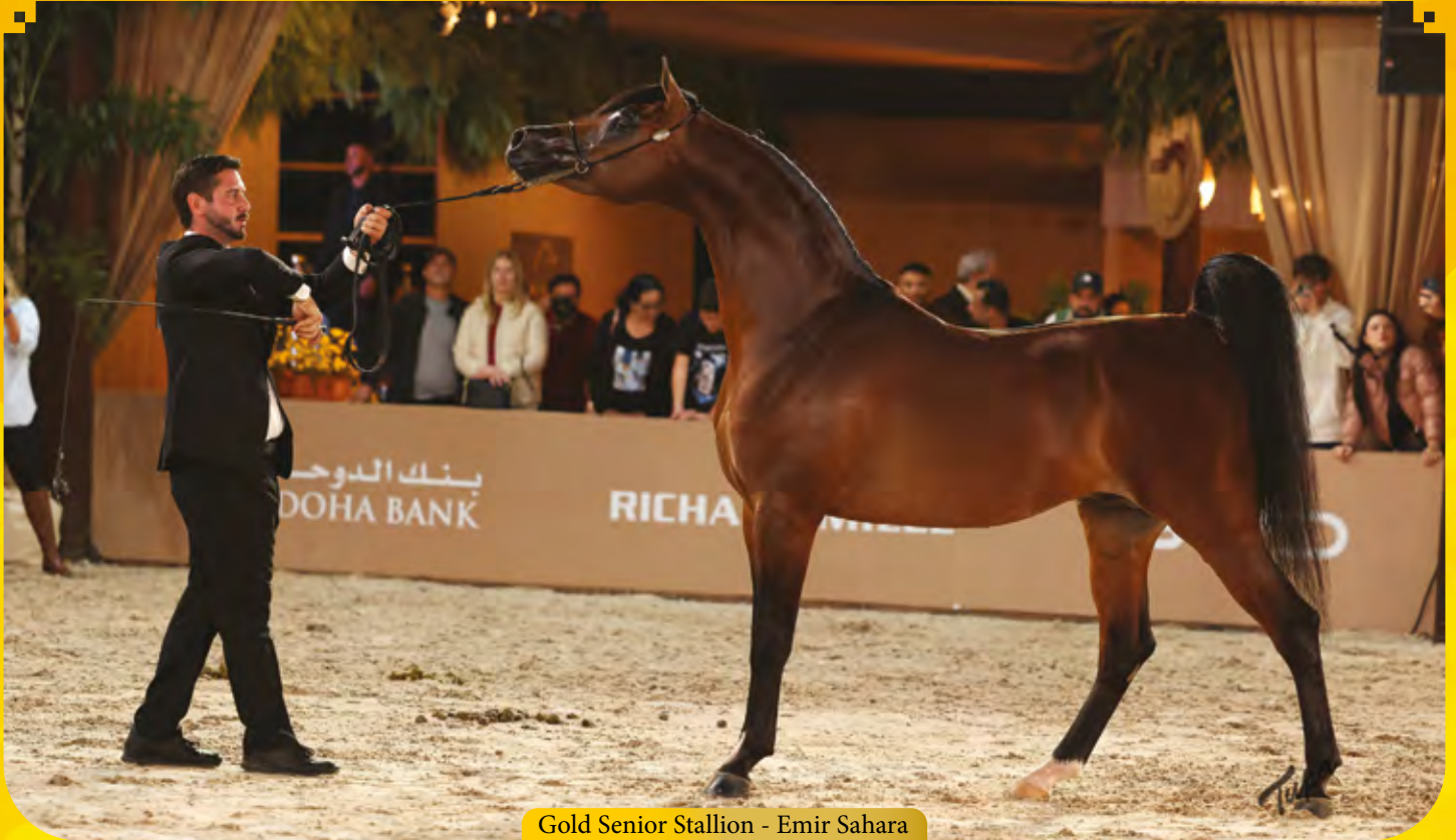
Gold Senior Stallion - Emir Sahara

There couldn't be a more fitting grand finale for the Brazilian National Show than the Senior Stallion Finals.