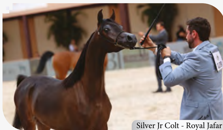
Silver Jr Colt - Royal Jafar