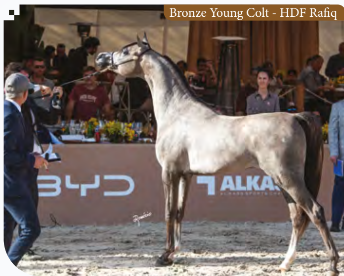
Bronze Young Colt - HDF Rafiq