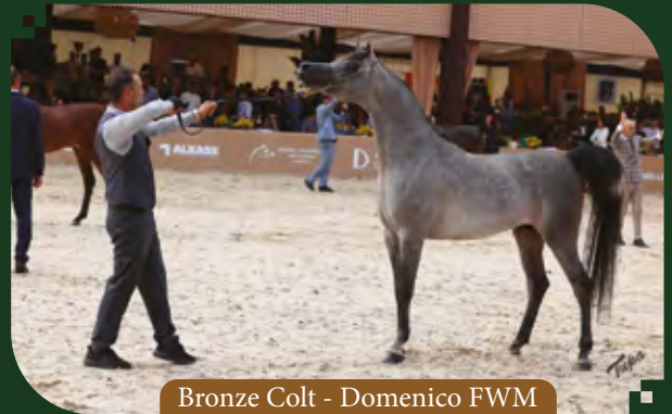
Bronze Colt - Domenico FWM