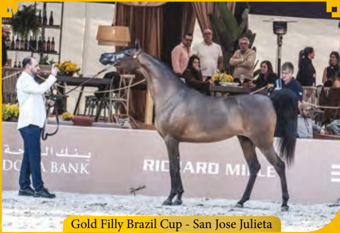
Gold Filly Brazil Cup - San Jose Julieta