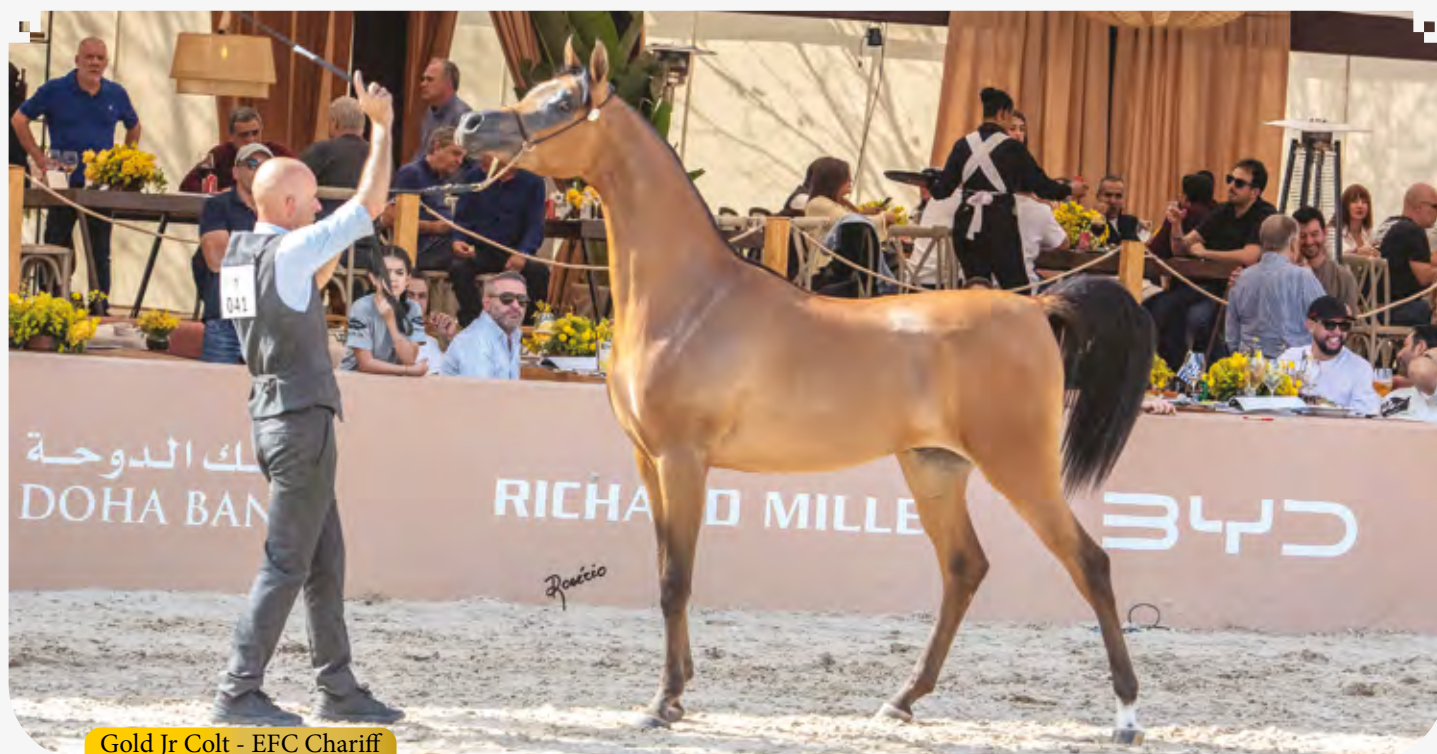
Gold Jr Colt - EFC Chariff

The Gold Champion Junior Colt was yet another testimony of HK Gran Valehoso's ability as a sire, even at his first foal crop. EFC Chariff, a handsome bay colt, bred and owned by EFC Arabians is out of Cherrie Yparadise JM, one of the farms' most distinguished broodmares, having produced several champions on National level and lately also at the GCAT show.