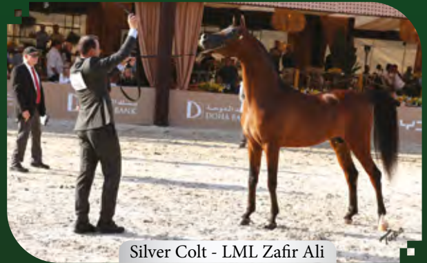
Silver Colt - LML Zafir Ali

The grey Domenico FWM, Bronze Champion Colt, was bred and is owned by Haras Lone Star. He is by Dominic M out of one of the farm's greatest producers, the beautiful grey Nahla el Madan by El Tino, also the mother of the multi-National Champion Bandit SRA daughter My Best Surprise FWM.