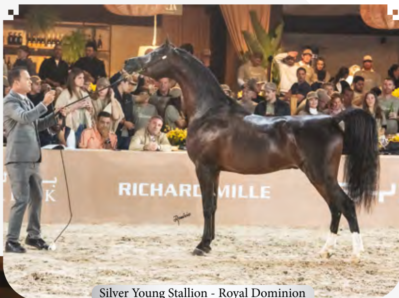
Silver Young Stallion - Royal Dominion