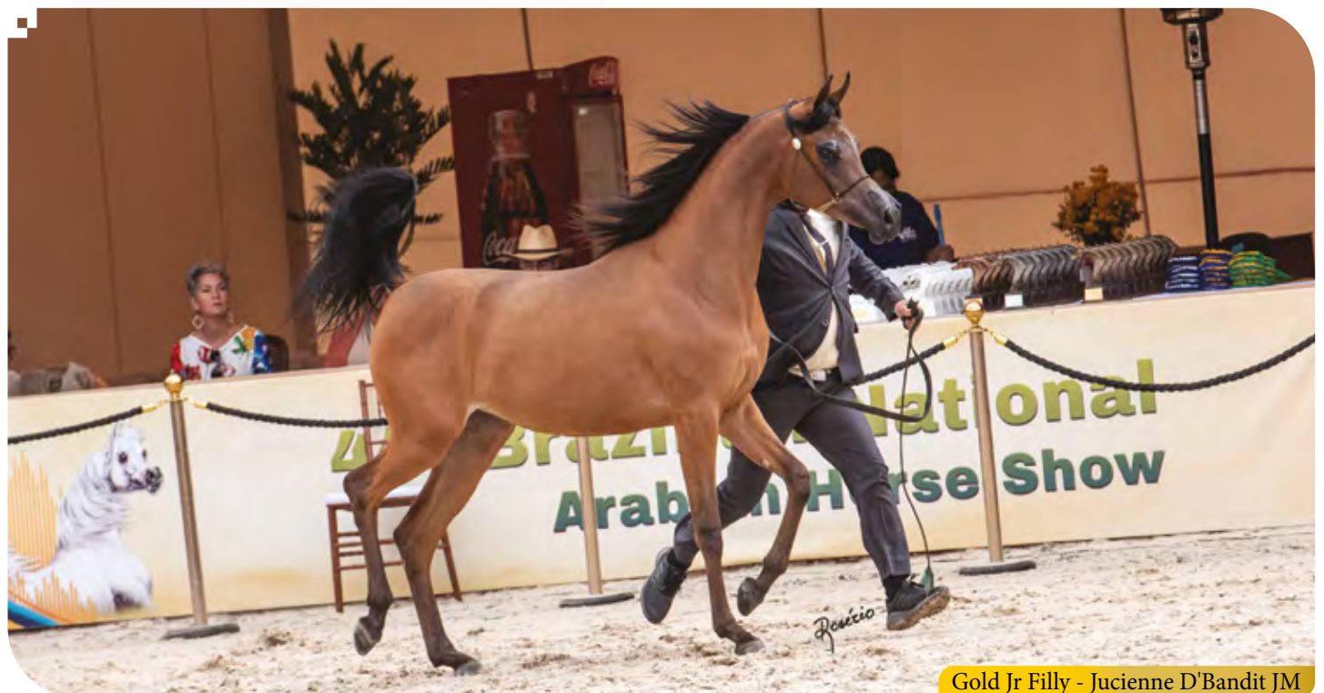
Gold Jr Filly - Jucienne D'Bandit JM