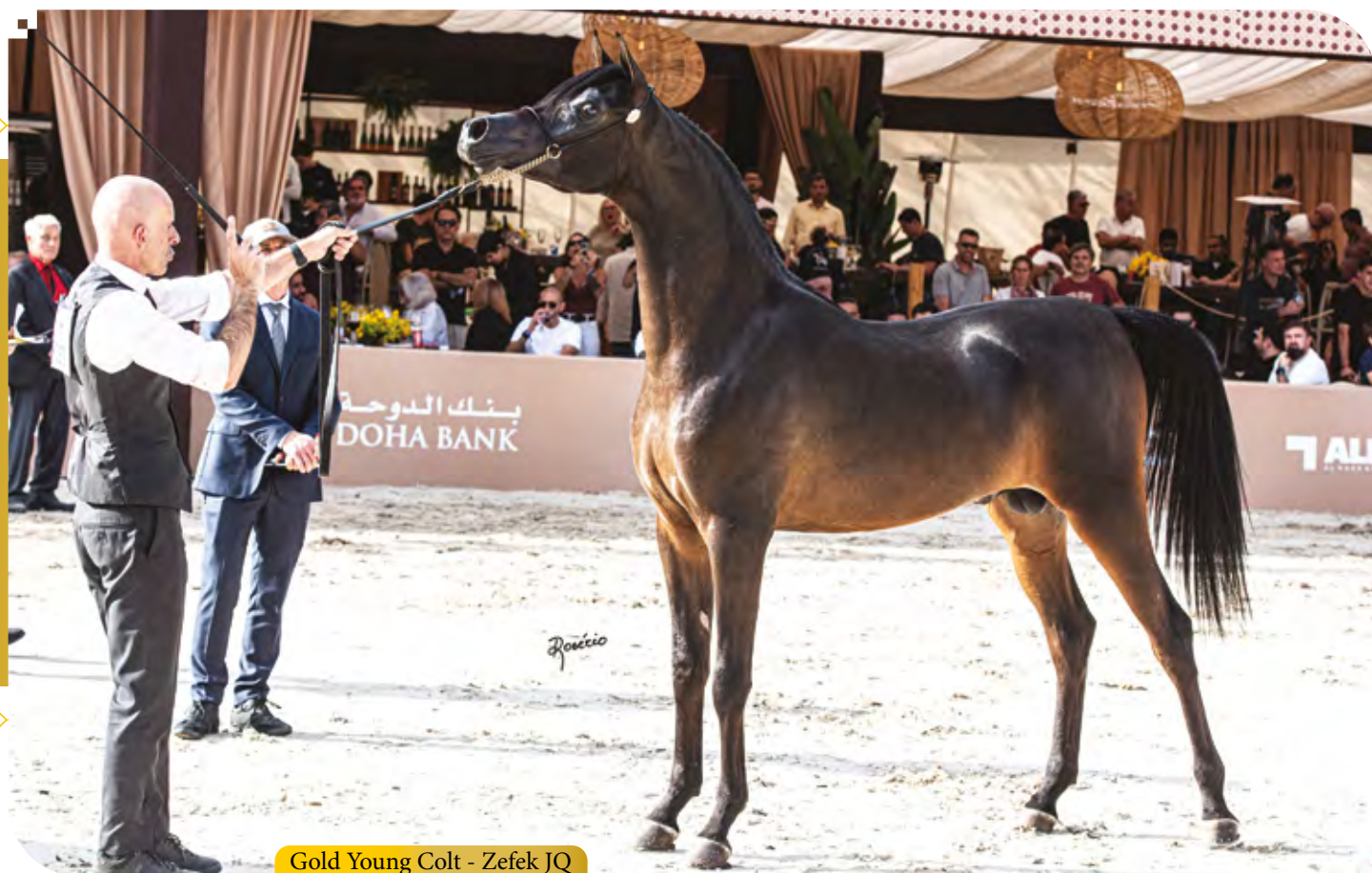
Gold Young Colt - Zefek JQ

Haras dos Faveiros also bred and showed the Gold Young Colt Champion Zefek JQ, a fourth generation homebred. Zefek JQ is by the champion sire Jyvar Meia Lua, a cross that seemed to be quite successful by glancing at this beautiful bay colt. His mother is the FA El Shawan daughter Gioconda Shawan JQ, who is out of daughter of the great Power World JQ.