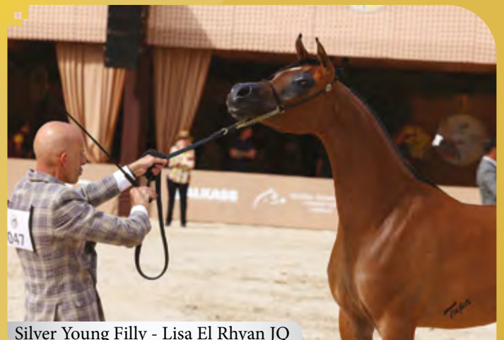
Silver Young Filly - Lisa El Rhyan JQ

Coming back in the Young Filly Championship, this time with the Gold Filly Champion, Haras Santa Marta won the title with the elegant bay Livia JSZ, a daughter of Jytan Meia Lua, a son of Brazilian and U.S. National Champion El Jahez WH and out of Domitila UB a full sister to the great World Champion Mare Baviera HVP, a daughter of Marwan Al Shaqab and HB Bessolea.