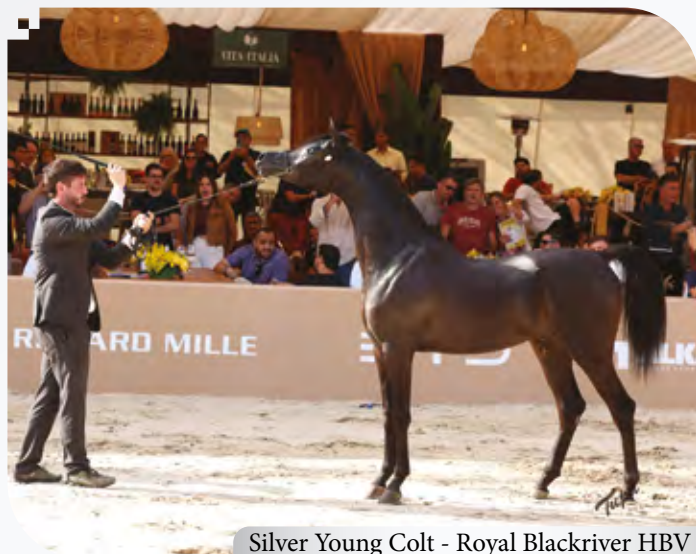
Silver Young Colt - Royal Blackriver HBV

HDF Rafiq, the Bronze Young Colt Champion is bred and owned by Haras das Faias and Haras Panquehue of the Bulnes Family in Chile. He is a full brother to multi National Champion Aziz MAM, being by the Chilean stallion HP Ali, who was bred by the Bulnes Family, who became known for printing his beautiful head into his foals and out of RL Alita MAM, a daughter of the Brazilian National Champion Colt El Shakhyr.