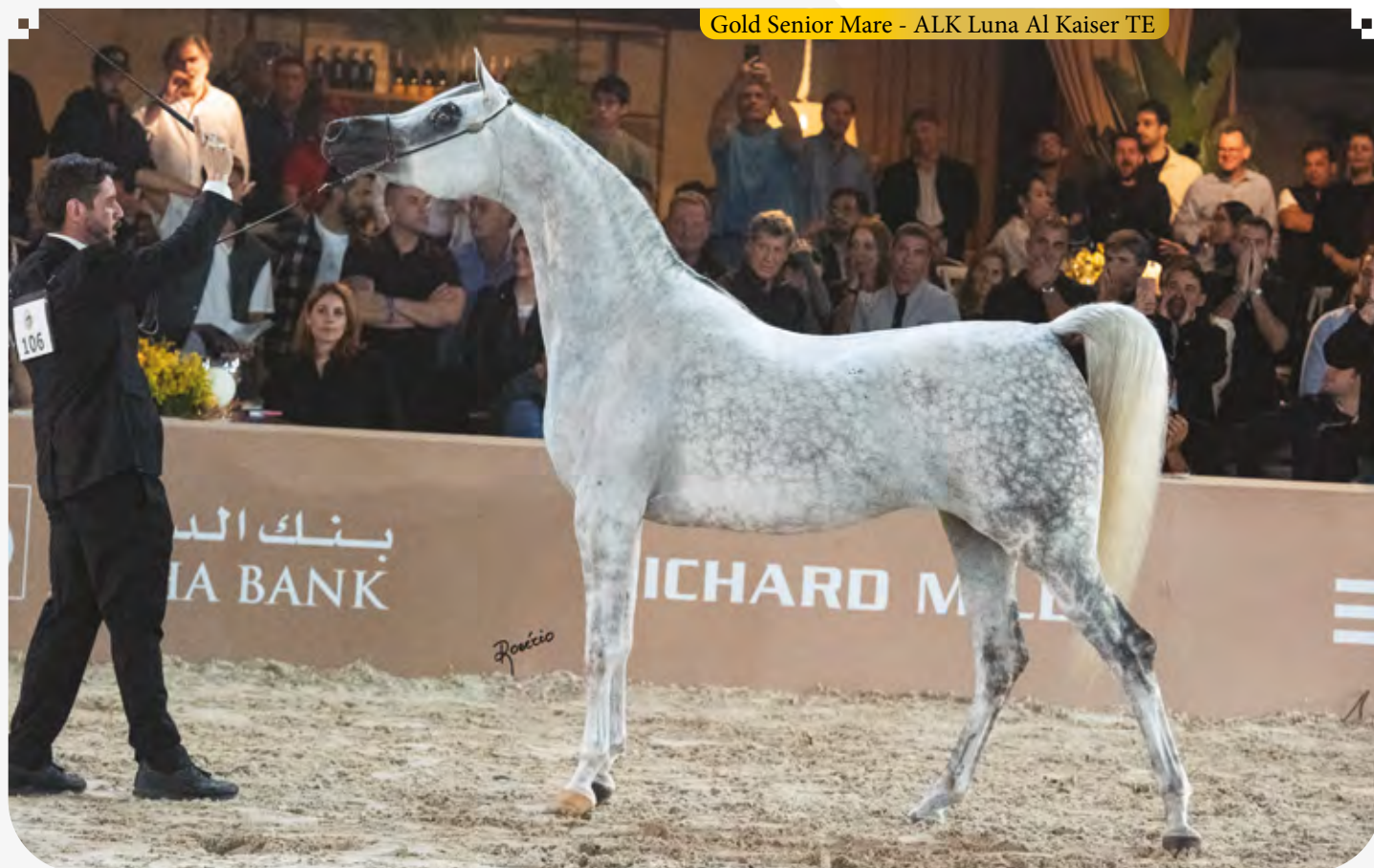
Gold Senior Mare - ALK Luna Al Kaiser TE

The Senior Mare Championship brought another parade of incredible mares to the ring. Once again, many previous national winners as long as new claimers of amazing quality were competing head-to-head to earn the highest honors.