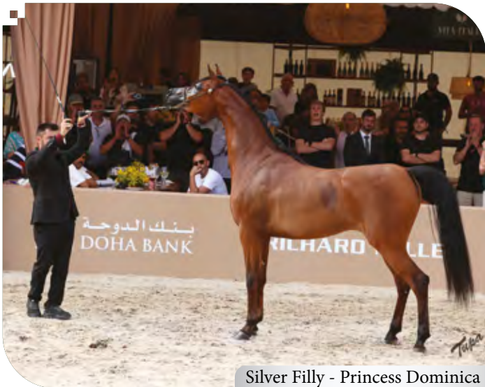
Silver Filly - Princess Dominica