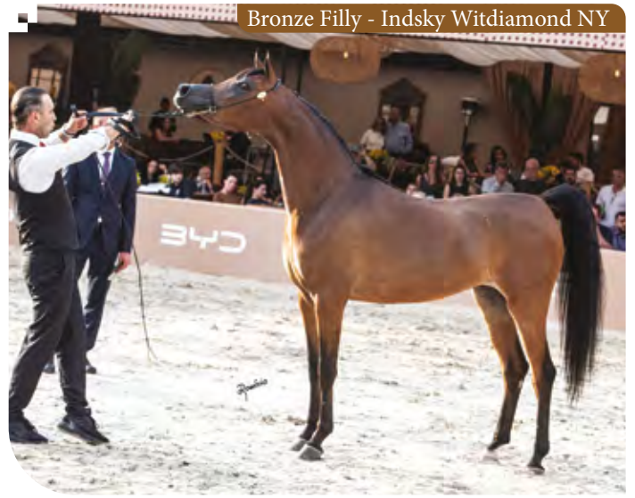
Bronze Filly - Indsky Witdiamond NY

Janeiro, very proud. She is by the stallion Quasim CRH and out of All I Needs Luv NY, a daughter of Pscore out of one of Namahe's greatest broodmares Desiree HBR, mother of three other National Champions, Utrillo NY and Naomi NY by Quartz NY and Siegerin NY by Power World JQ.