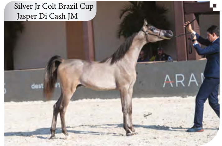
Silver Jr Colt Brazil Cup Jasper Di Cash JM

refined Ragnary GV and out of Princess Aliya FWM a direct daughter of the ethereal Queen Aida FWM and by El Tino, hence a full sister to the Brazilian National Gold Champion Colt Razeer Serondella.