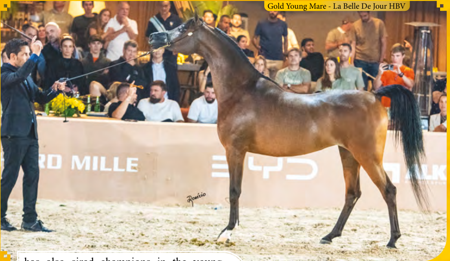
Gold Young Mare - La Belle De Jour HBV