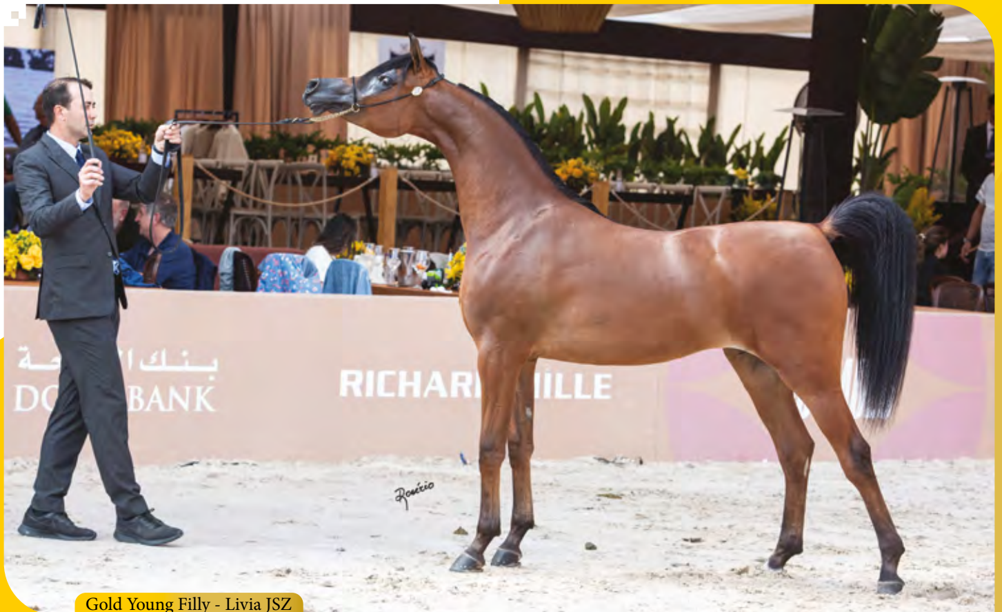
Gold Young Filly - Livia JSZ