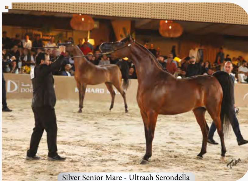
Silver Senior Mare - Ultraah Serondella

Winning the Silver was the many times national champion Ultraah Serondella, bred and owned by Haras Serondella. A daughter of Quasim CRH she has produced the 2024