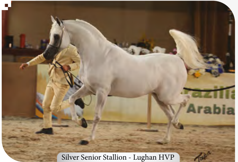
Silver Senior Stallion - Lughan HVP