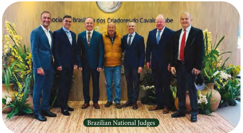
Brazilian National Judges