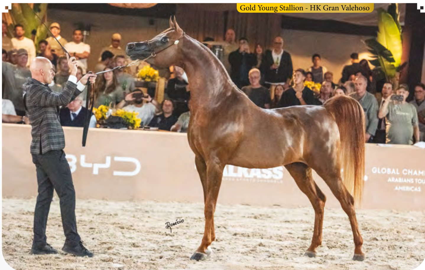
Gold Young Stallion - HK Gran Valehoso