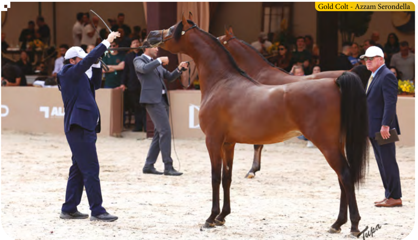
Gold Colt - Azzam Serondella