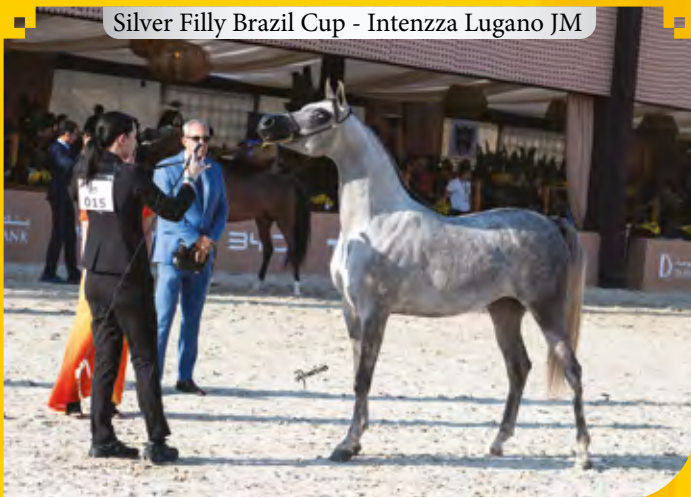
Silver Filly Brazil Cup - Intenza Lugano JM