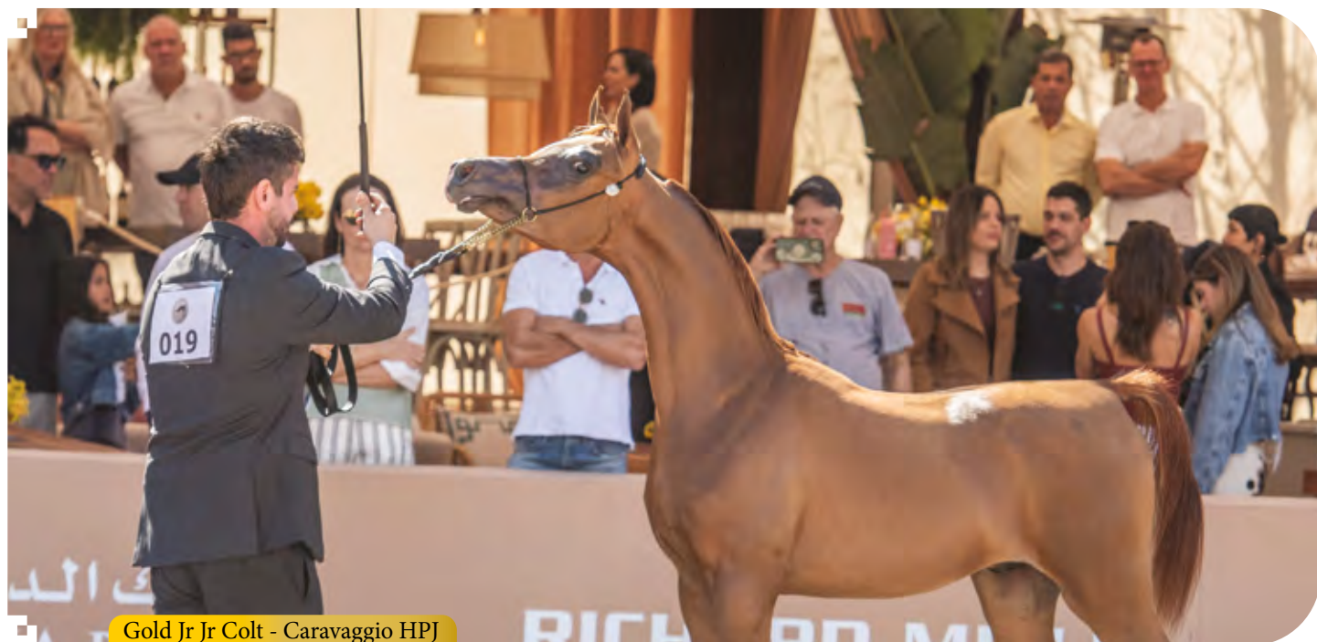
Gold Jr Jr Colt - Caravaggio HPJ