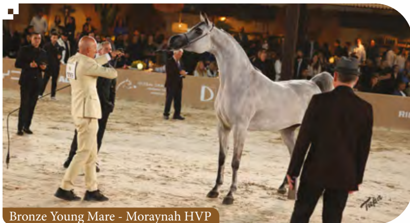
Bronze Young Mare - Moraynah HVP