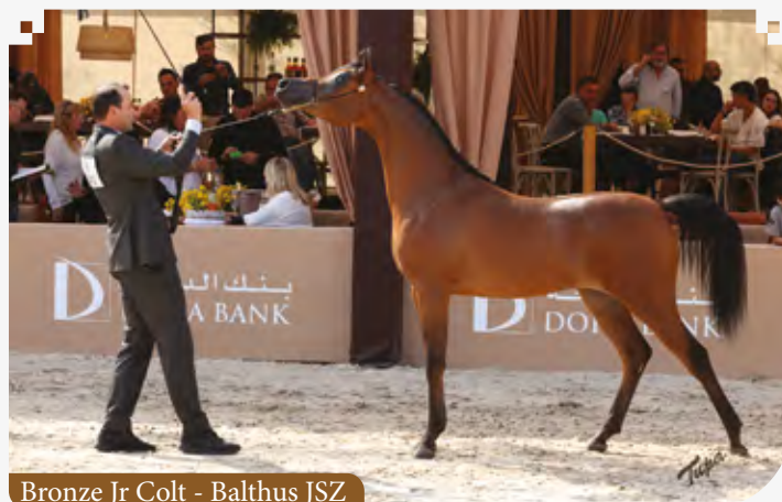
Bronze Jr Colt - Balthus JSZ