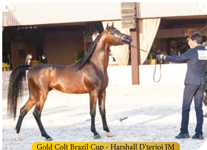
Gold Colt Brazil Cup - Harshall D'terjoi JM