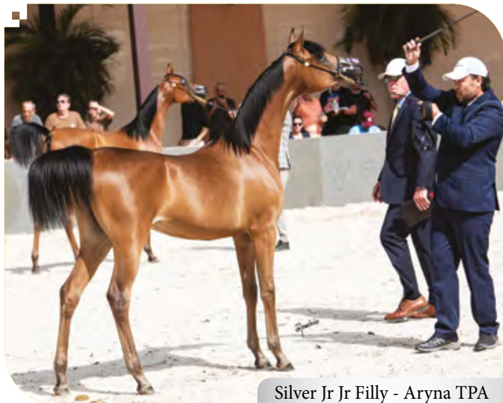
Silver Jr Jr Filly - Aryna TPA