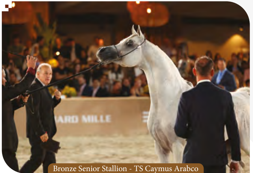
Bronze Senior Stallion - TS Caymus Arabco