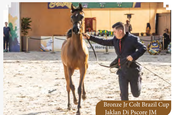
Bronze Jr Colt Brazil Cup Jaklan Di Pscore JM

Haras JM made his mark by winning the Silver and Bronze Champion respectively. The Silver went to Jasper di Cash JM, a son of the Brazilian National Silver Champion Stallion Cash del Tino JM out of Maisa LM, a daughter of the great DA Valentino son, Vitorio TO. The Bronze Champion Jaklan di Pscore JM, is a son of one of the farm's chief sires, the famed Padrons Psyche son Pscore. His mother is a daughter of Jahd el Jamaal, a son of the great Ali Jamaal and the legendary Bey Shah daughter NV Justa Dream.