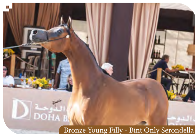
Bronze Young Filly - Bint Only Serondella

The Bronze Young Filly Champion the bay Bint Only Serondella, bred and owned by Haras Serondella, is yet another decorated daughter of the famed Only Serondella and by Razeer Serondella, a Brazilian Gold National Champion Colt by El Tino out of the Brazilian and U.S. National Champion Mare Queen Ayda FWM, by FA El Shawan.