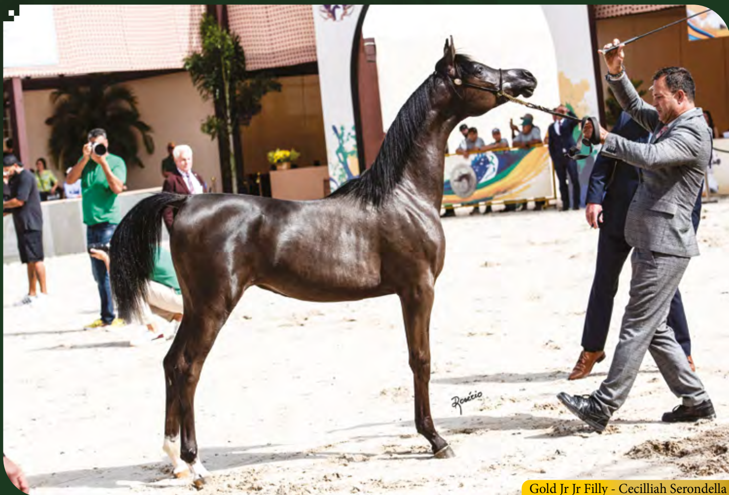
Gold Jr Jr Filly - Cecilliah Serondella

Maximillion NA (Dominic M x Makala NA), bred by North Arabians and Owned by TP Arabians, sired the Silver Junior Junior Champion Filly Aryna TPA (x Rhona Vul do Divino), an exotic bay filly bred and owned