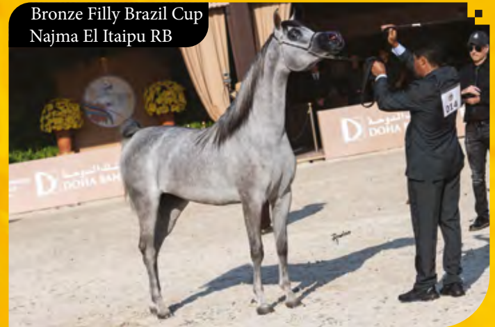
Bronze Filly Brazil Cup Najma El Itaipu RB

Bronze was Najma el Itaipu RB, a daughter of the popular Brazilian National Champion and International Champion Sire TM Itaipu